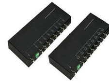
8 In 1 Signal Superimpose