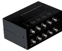
4 In 1 Signal Superimpose