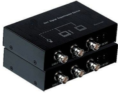
2 In 1 Signal Superimpose